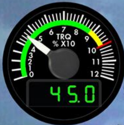
MANUAL NO 8765100-112 TORQUE (TRQ) DJ PN 65100-112