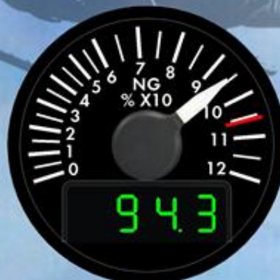
MANUAL NO 8764000-112 NG %RPM DJ PN 64000-112