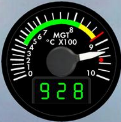
MANUAL NO 8761000-112 TEMPERATURE (MGT) DJ PN 61000-112