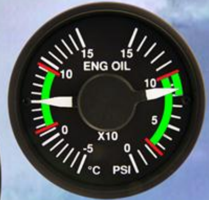
MANUAL NO 8765000-112 ENGINE OIL (OPT) DJ PN 65000-112