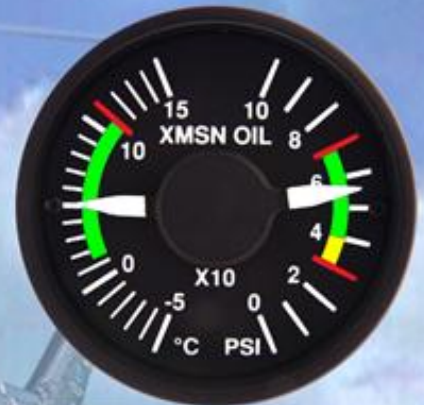
MANUAL NO 8765000-212 XMSN OIL (OPT) DJ PN 65000-212